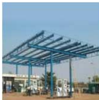
Patrol Pump, Pune-Satara Road, Indian Oil Corporation