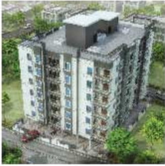
Morning Dew, Shinde Builders, Ambegaon, Pune.