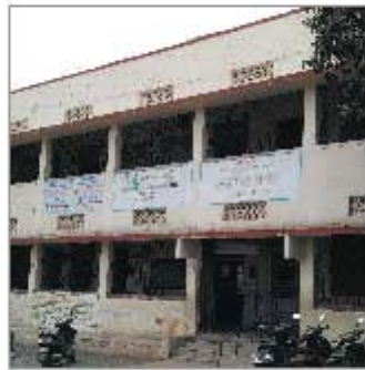
School Buildings, Katraj, Pune Municipal Corporation (PMC).