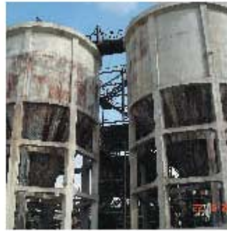
Storage Bins at Hutti Gold Mine, Raichur, Karnataka.