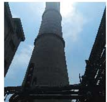
RCC Chimney at Khaperkheda, Thermal Power Plant, Mahagenco, Nagpur.