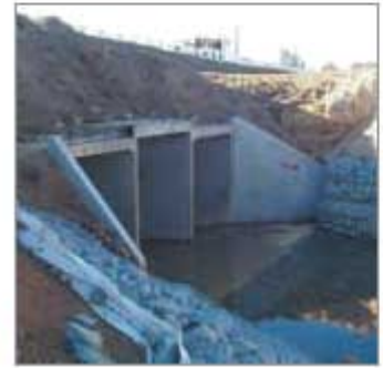
Culvert at Dapodi, Pune.