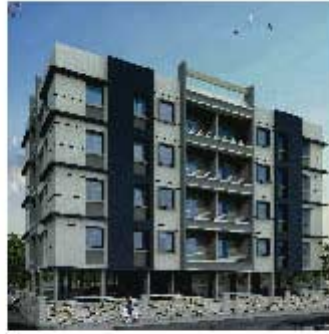
Vighnaharta Heights, Vighnaharta Developers, Katraj, Pune.