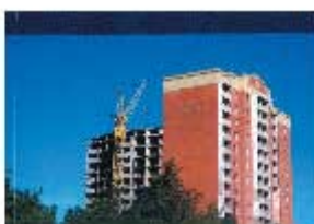
Performance Evaluation of Existing RCC Structure