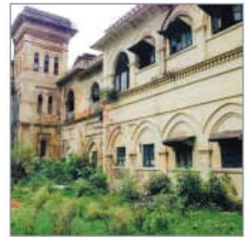
Court Building at Morwad, Pimpri Chinchwad (PCMC)