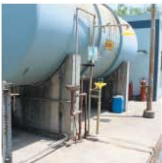
Heavy Water Plant, Bedoda, Gujarat.