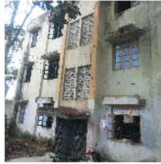
Staff Quarter Building, Akurdi, PCMC.