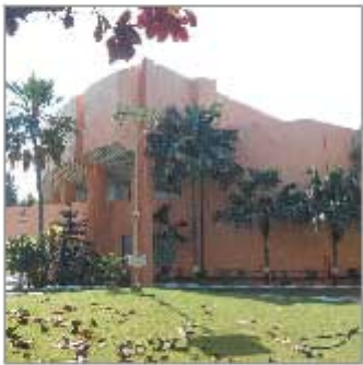
Institute of Reserve Studies ONGC (Oil and Natural Gas Corporation) Ahmedabad, Gujarat