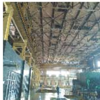
Khaperkheda Thermal Power Plant, Mahagenco, Nagpur, Maharashtra.