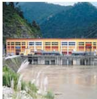
Ghadgar Hydro Power Station, Mahagenco, Thane, Maharashtra.