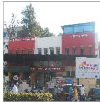
Hospital Building at Akurdi, Pimpri Chinchwad (PCMC)