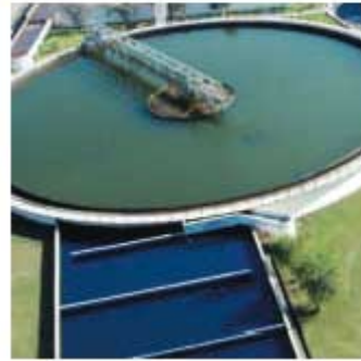
Water Treatment Plant, Nigedi, PCMC.