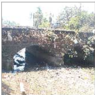
Pantawane Bridge, Ratnagiri, Nagar Parishad, Ratnagiri.