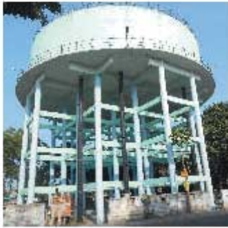
Elevated Storage Reservoir (ESR), Kalewadi, PCMC.