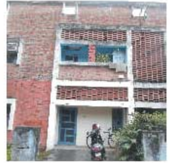
Residential Quarters at PGIMER, Chandigarh.