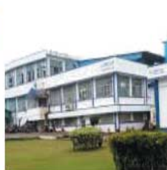
UKB Electronics Pvt. Ltd., Ranjangaon MIDC.