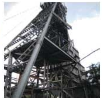
The Hutti Gold Mine Ltd., Raichur, Govt. of Karnataka.